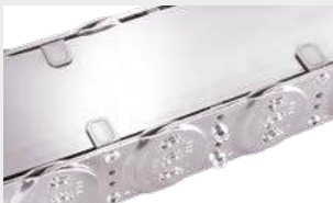
Steel band holder on the sidebands.

Steel band covers for the other types on request!