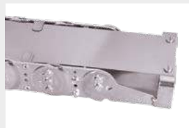
Fastening on the cable carrier connection with special end connector.