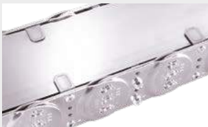
Steel band holder on the sidebands.

Steel band covers for the other types on request!